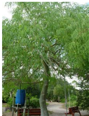
Fig 15. A Moringa stenopetala tree at ECHO (Florida).