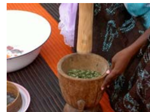
Fig. 4. Pounding moringa leaves to make leaf powder.

the water or boiling the leaves more than once. In addition, making sauces with leaf powder instead of fresh leaves appears to be quite popular because it saves time and is easy to use." (Fig. 4)