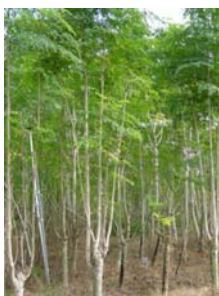
Fig. 6-7. Moringa trees growing at ECHO (Fig. 6; left) and as a household tree in Africa (Fig. 7; right)