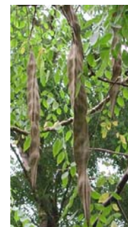
Figs 17-18. Flowers (left; Fig. 17) and pods (right; Fig. 18) of Moringa stenopetala in Haiti.