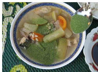
Fig. 5 Moringa leaf powder added to food.

Would they be receptive to adding new foods, such as moringa pods, to their diets? "This has been surprisingly successful, since new foods are often very difficult to introduce in West Africa. People interviewed have shown considerable inventiveness when it comes to preparing moringa pods, seeds and flowers."