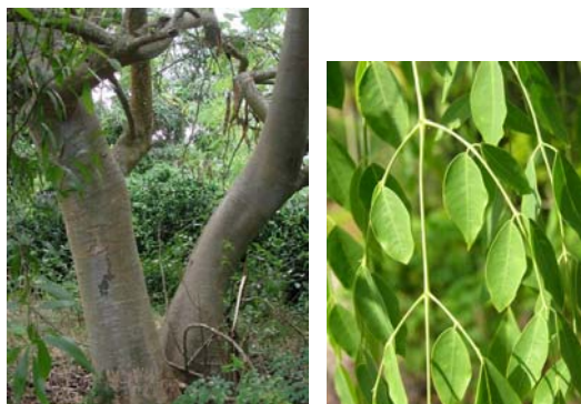
Fig 16. Trunk and leaves of Moringa stenopetala . Photo by Tim Motis

Compared with M. oleifera , the trunk of M. stenopetala is considerably thicker at the base, the tree seems more vigorous, the leaves are larger, and if tasted raw the leaves are milder (Fig. 16). Dr. Jahn says that in the Sudan M. oleifera develops into a slender tree, M. stenopetala into a round shrub-like tree.